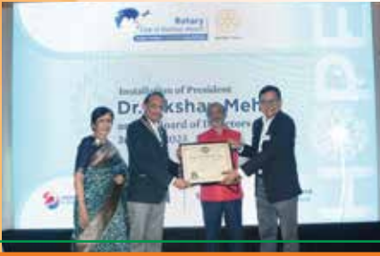
Change of honour and responsibility