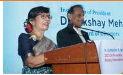
First Lady introducing the incoming President