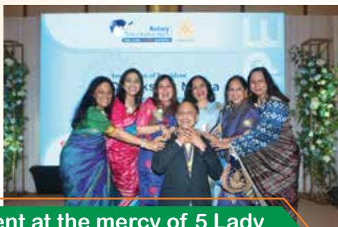
President at the mercy of 5 Lady Directors and 1 Club Trainer