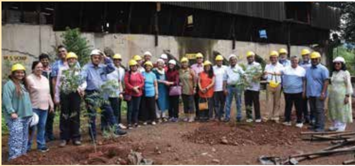
President and First lady leading the tree plantation drive