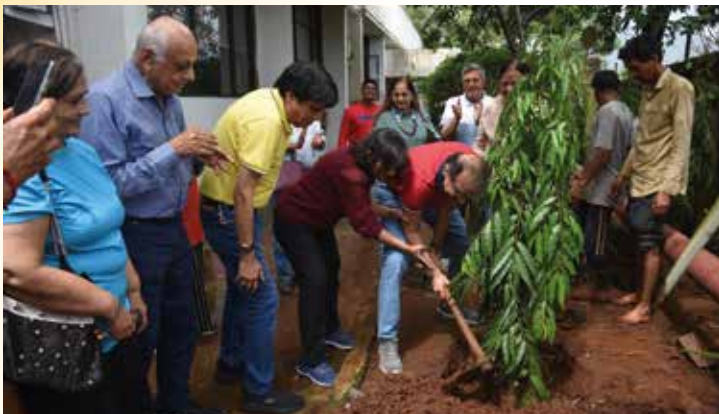
Enthusiastic members @ John Galt Premises for intensive tree plantation